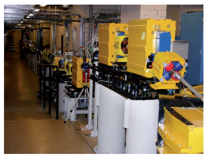
Beam Transport and Switching

Using a sophisticated 3D CAD algorithm, ECM engineers were able to analyze the as-built concrete features of all three treatment rooms simultaneously and identify the correct alignment that minimized construction variations in the building, and optimized the proton beam position to meet the demanding requirements