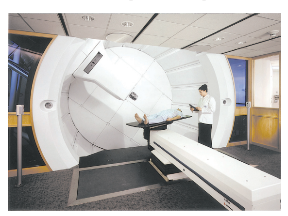
Patient Treatment Area at a Proton Therapy Center

the depth at which the beam energy is optimized. To achieve optimum performance, the critical components that accelerate, position, and deliver the beam of protons to the patient